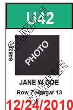
South Valley Regional