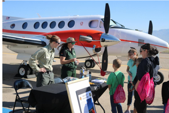
Participants enjoy a previous Girls in Aviation Day

Women in Aviation is a nonprofit organization designed to support the advancement of women in all aviation career fields and interests. The organization created Girls in Aviation Day to give girls the opportunity to learn more about the many career opportunities in the aviation industry.