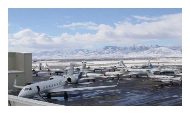
General Aviation parking during the 2002 Olympics