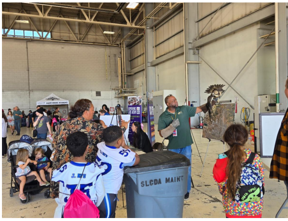
SLCDA's wildlife mitigation team brought a captured hawk to show participants