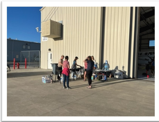
Tenants, pilots and other attendees gathered in the hangar

Airport tenants—from flight schools to maintenance services—mingled with SLCDA employees and members of The Ninety-Nines. It was a celebration of general aviation at U42. Special thanks to The Ninety-Nines for providing breakfast!