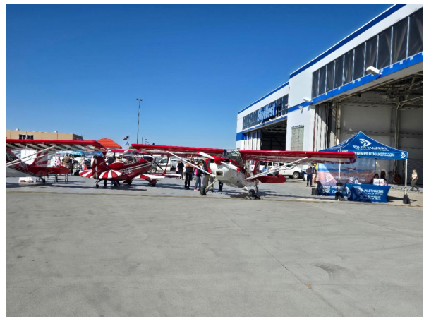
A variety of aircraft were on display at the event