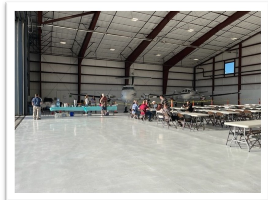
The Ninety-Nines prepared breakfast for attendees