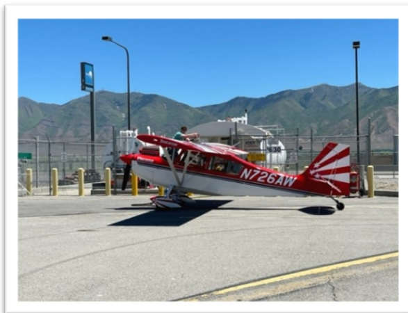
A pilot refuels an aircraft at the 100LL fuel farm.

As SLCDA moves forward to implement the TVY Master Plan the airport stands ready to meet the growing demands of the General Aviation community.