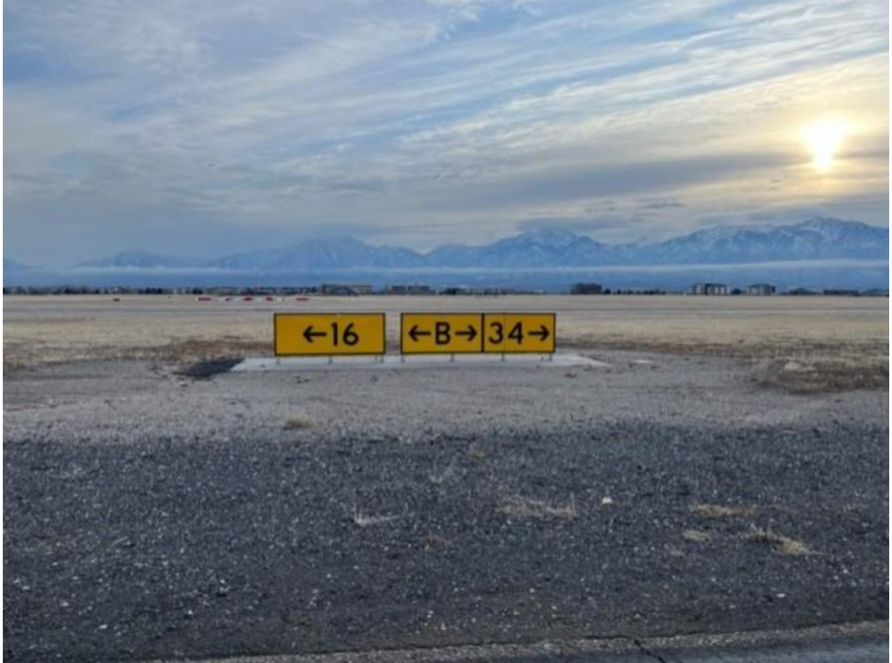
Newly installed LED directional sign at SVRA