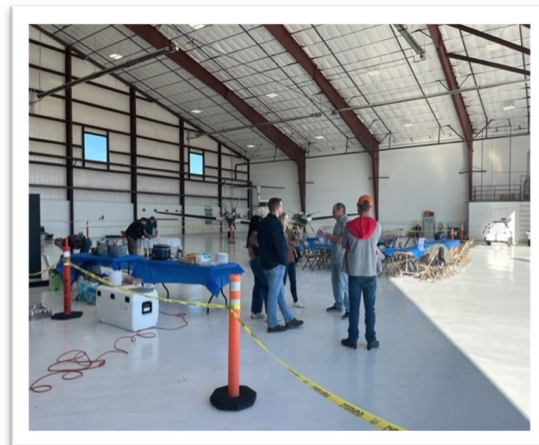
Aspiring pilots and seasoned aviators gathered for the open house