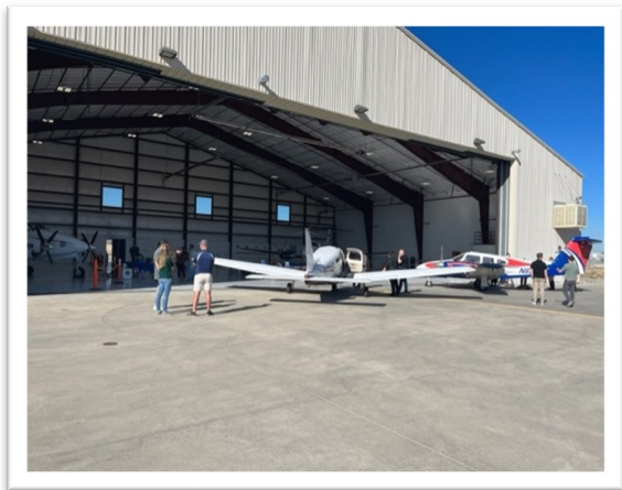
Various aircraft were parked outside hangar 3

At the open house, Randon Aviation answered participants' questions, provided demonstrations and discussed advancements in aviation technology. They also hosted an in-depth tour of their facilities. The event emphasized the importance of quality training at every stage of a pilot's journey—from private pilot to certified flight instructor (CFI) and multi-engine ratings.