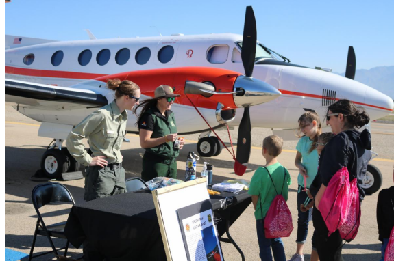
Participants enjoy a past Girls in Aviation Day

Women in Aviation is a nonprofit organization designed to support the advancement of women in all aviation career fields and interests. The organization created Girls in Aviation Day to give girls the opportunity to learn more about the many career opportunities in the aviation industry.