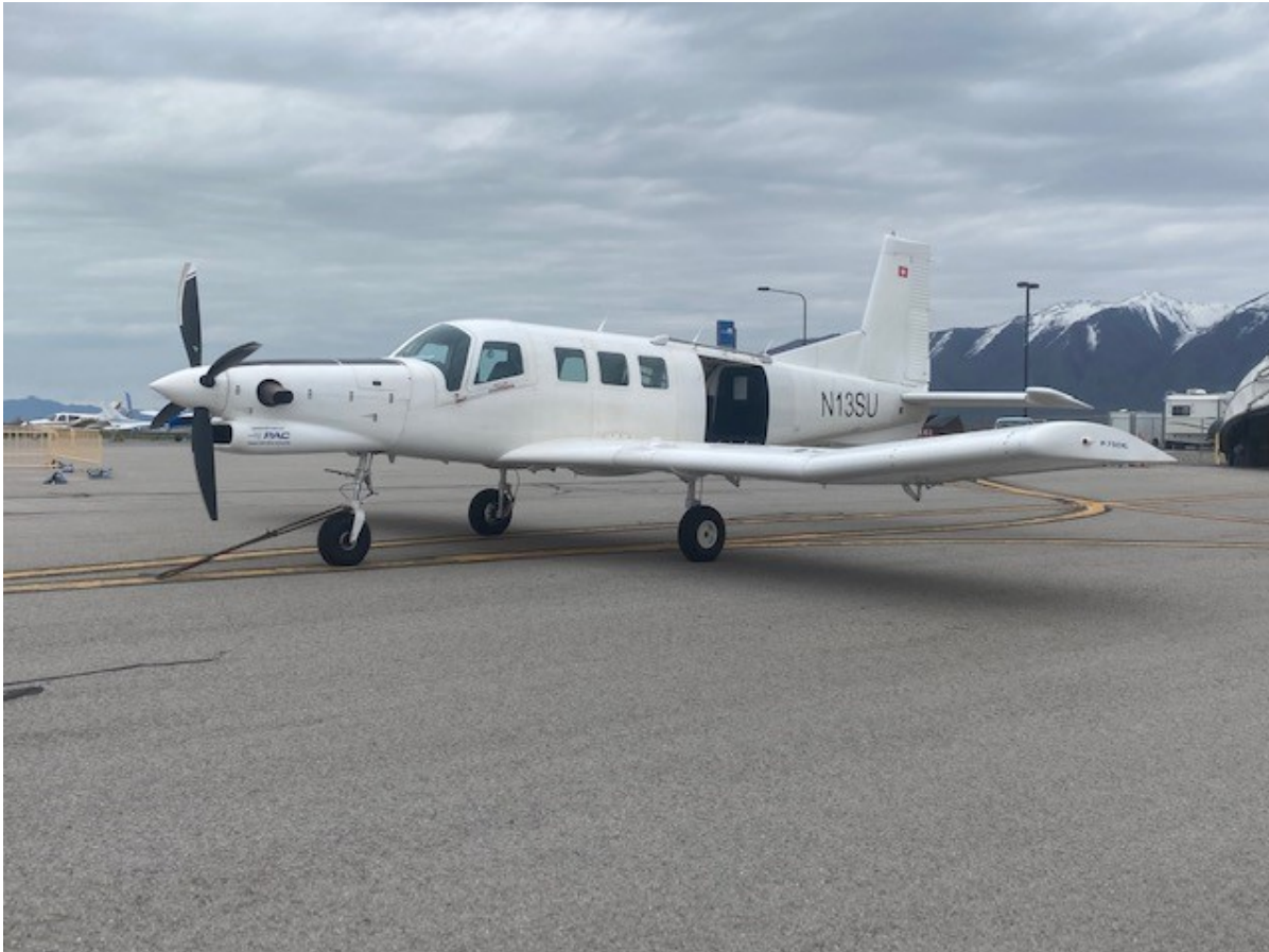
A PAC750XI aircraft used by Skydive Utah

Skydive Utah kicked off its 2023 season on April 1. The group will operate daily using a PAC750XI aircraft, which is manufactured by Pacific Aerospace of New Zealand and is the only jump aircraft specially designed for skydiving. More information on Skydive Utah can be found at www.skydiveutah.com .