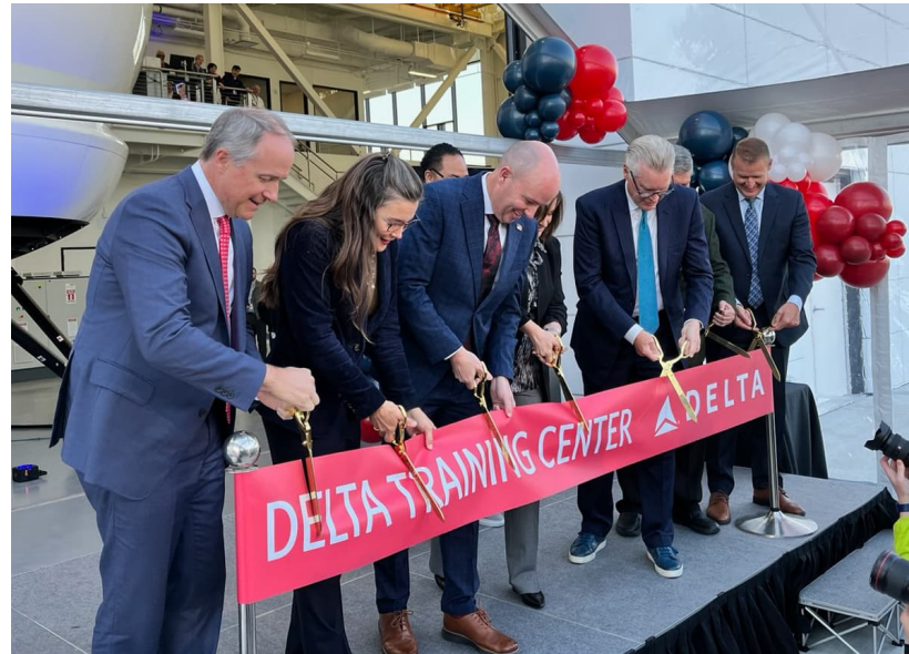
Mayor Erin Mendenhall joined Governor Spencer Cox and Delta CEO Ed Bastian at the ribbon cutting for the new Delta Training Center.

Delta Air Lines opened a new, $50 million, 50,000-square-foot, state-of-the-art pilot training facility near the Salt Lake City International Airport on Dec. 4. The event was attended by Delta leaders, Salt Lake City-based employees, local government officials and community members. With thousands of Delta pilots routed into the city for extended stays during training cycles throughout the year, the facility will also support the local SLC economy.