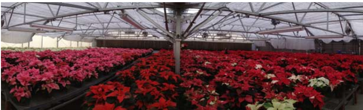
Poinsettias grown in the Airport's greenhouse are in full bloom and ready to move into the terminals for the holidays.

"During his fifteen year tenure on the Board, the Airport weathered airline financial issues, dealt with the aftermath of 9/11, hosted the Winter Olympic Games and managed a myriad of situations and challenges," she noted, "His stable influence and guiding hand was integral to our success."