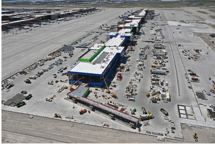
Concrete Paving Moves Forward at a Clip