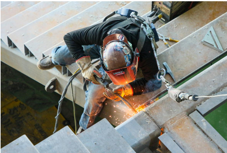
Welder works to reinforce staircase in Concourse B-Phase 4