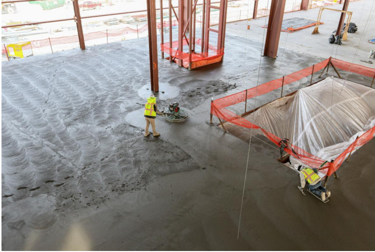
Concrete is prepared for terrazzo flooring in Phase 4 of The New SLC