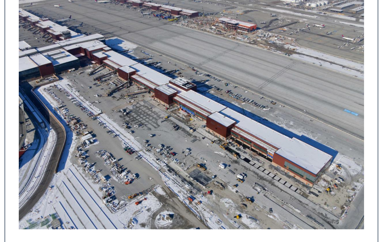
Aerial view of Concourse A-east and the beginnings of Concourse B-east, looking northwest