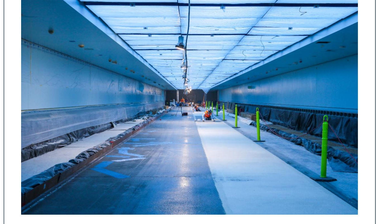
Preparing for Terrazzo flooring installation in the Central Tunnel