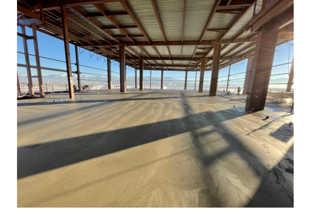
Final concrete pour on level two of Concourse A-east.