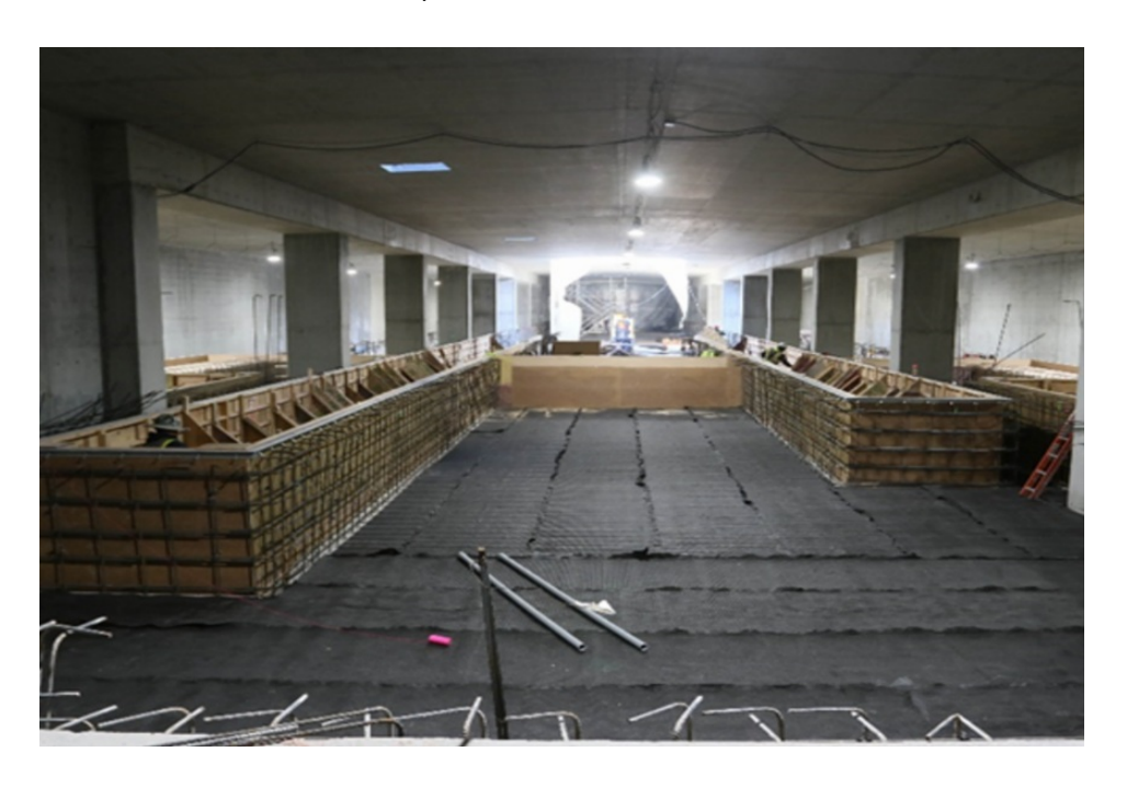
Passenger circulation cell in the Central Tunnel taking shape.