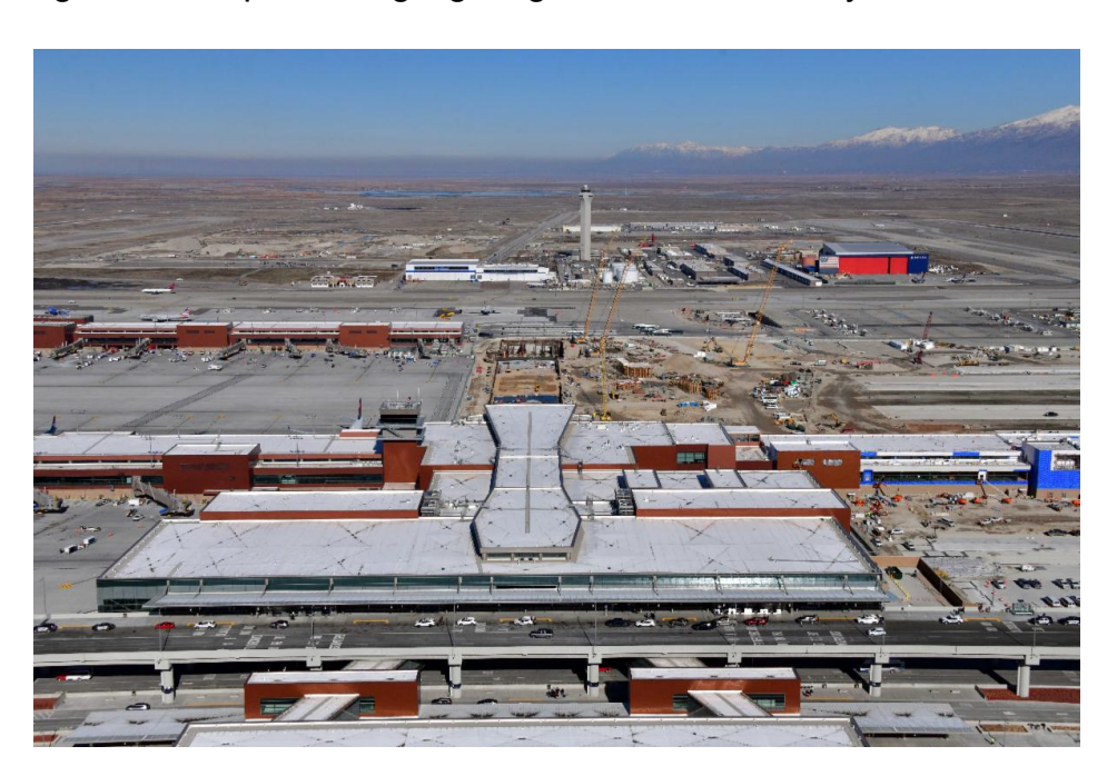
Aerial view of the terminal and central tunnel, looking north.

It's a beehive of activity on the construction site of The New SLC-Phase 2. Following are a few photos highlighting the work underway.