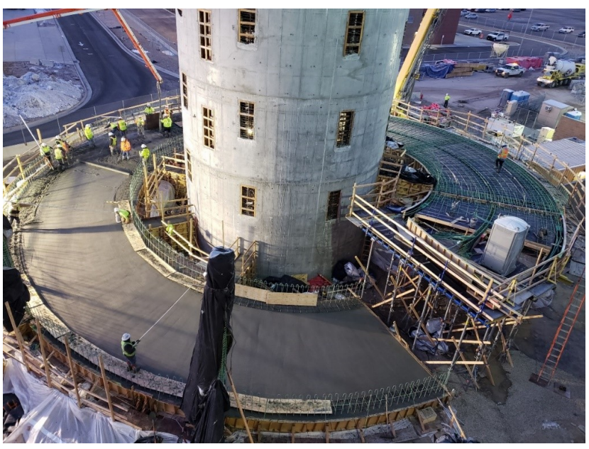
Helix under construction for The New SLC Parking Garage