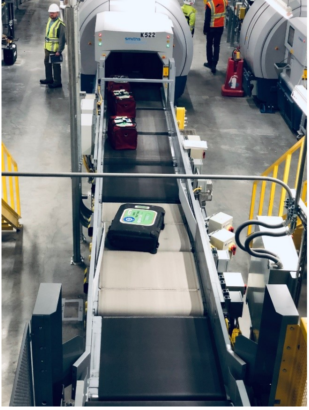
Testing of The new SLC baggage inspection system