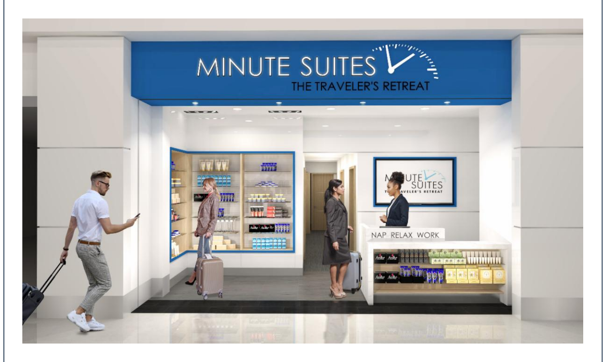
Minute Suites – one of the new amenities set to open in Phase 2 – will offer travelers a private retreat to nap, relax and work.

When selecting Phase 2 concessions, the airport wanted a mix of local, regional and national choices, while taking into consideration pricing, hours of operation and service standards. When the first phase of The New SLC opened, all concessions began offering street pricing, which is a requirement for Phase 2 as well.