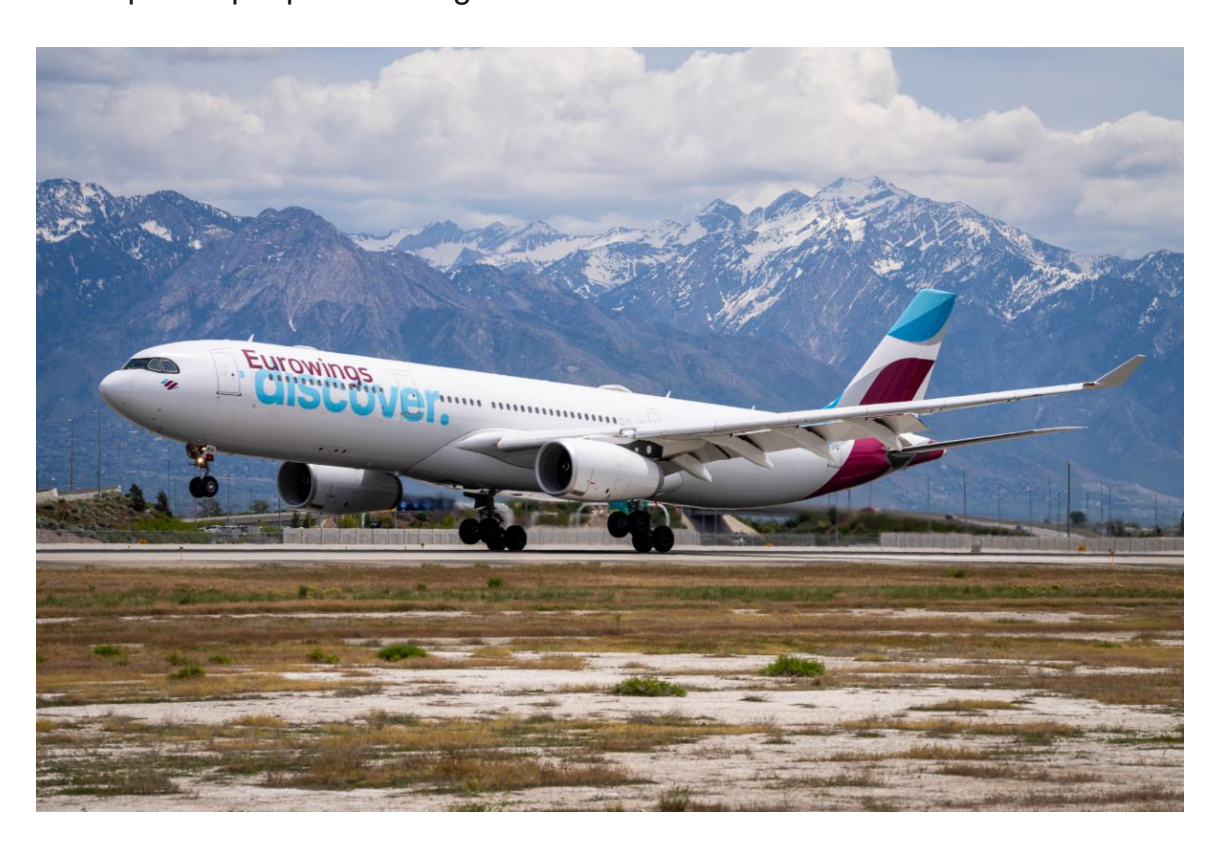
Eurowings Discover landing at SLC International for the first time on May 23.

On May 23, the much-anticipated Eurowings Discover flight from Frankfurt landed with great fanfare and celebration. This is the airport's first-ever direct flight to Germany and fourth destination in Europe. Three days later, Spirit Airlines' bright yellow planes entered Salt Lake City's skies for the first time with daily flights to Las Vegas, Los Angeles and Orlando. The ultra-low-cost carrier hopes to make travel more affordable in the area by offering low fares to the places people want to go most.