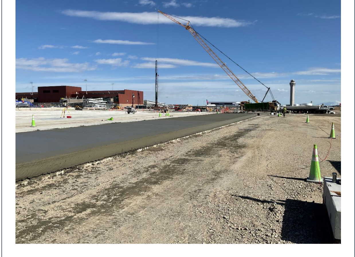
Paving over the Central Tunnel to prepare for future airplane taxiing.