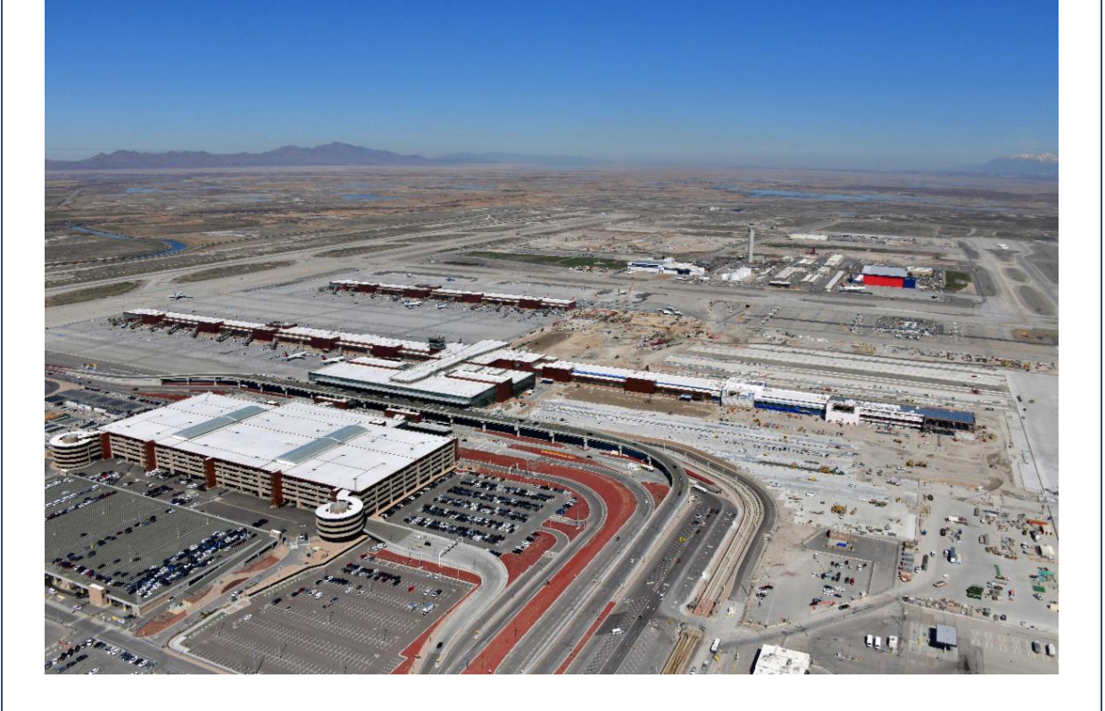
Aerial view of the Terminal, Concourses A and B, and the Central Tunnel, looking north.