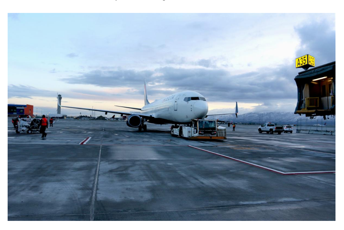
Aircraft fit test for the five gates now operating on Concourse A-east