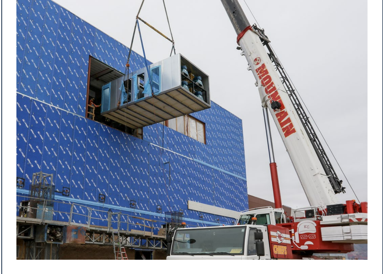
Delivery of air handling units on Concourse B-east