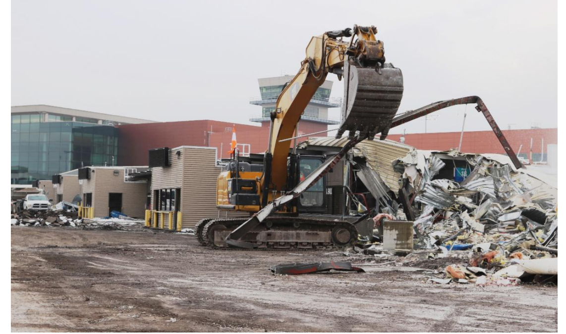
Concourse E was demolished earlier this year to makeway for The New SLC international gates.

In light of fewer passenger traffic--from a high of 30,000 per day this past winter to as low of 1,300 in April--the SLC team has been exploring options to determine the best way to move forward with Phase II of The New SLC Redevelopment Program.