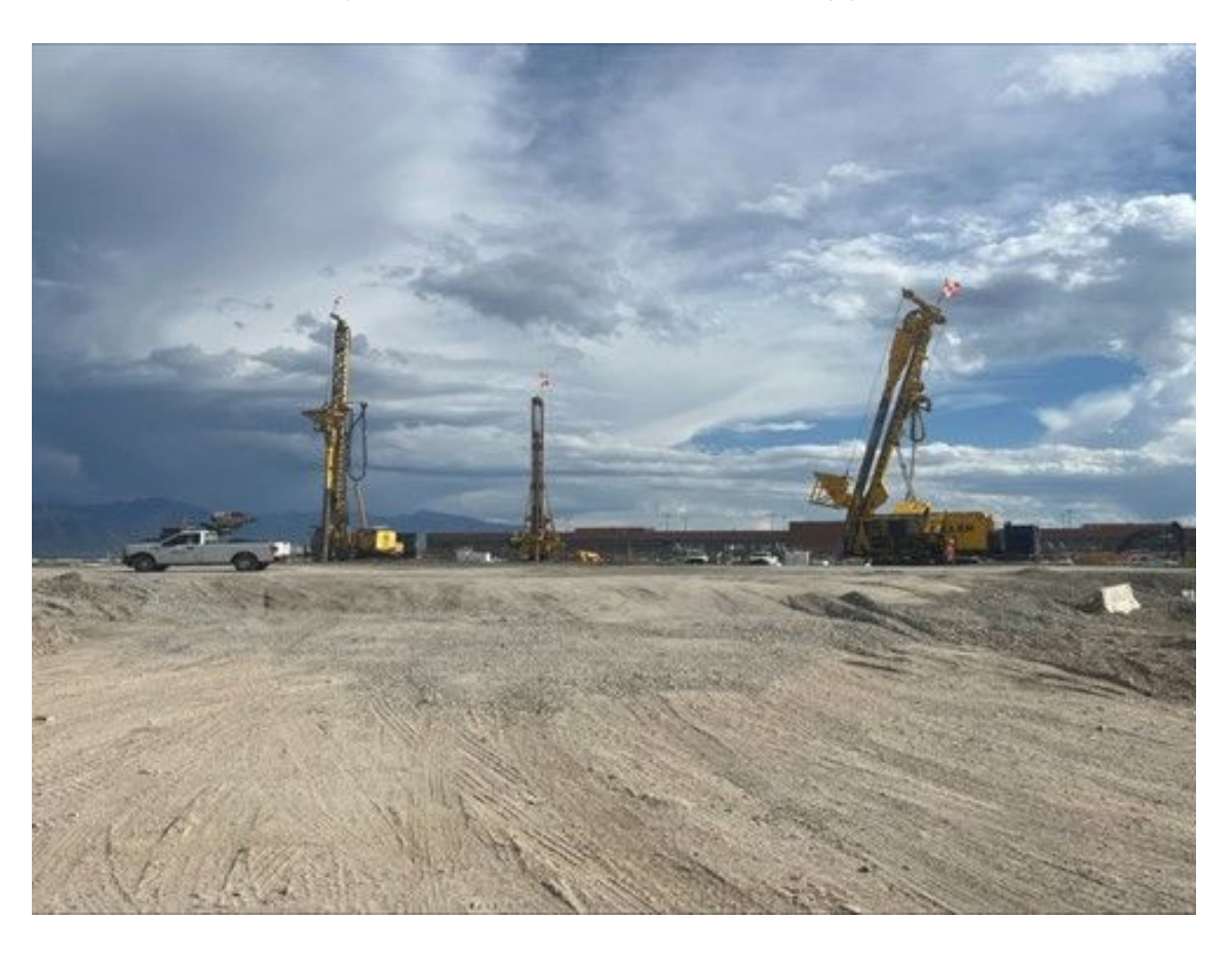
Started installing stone columns for Phase 4