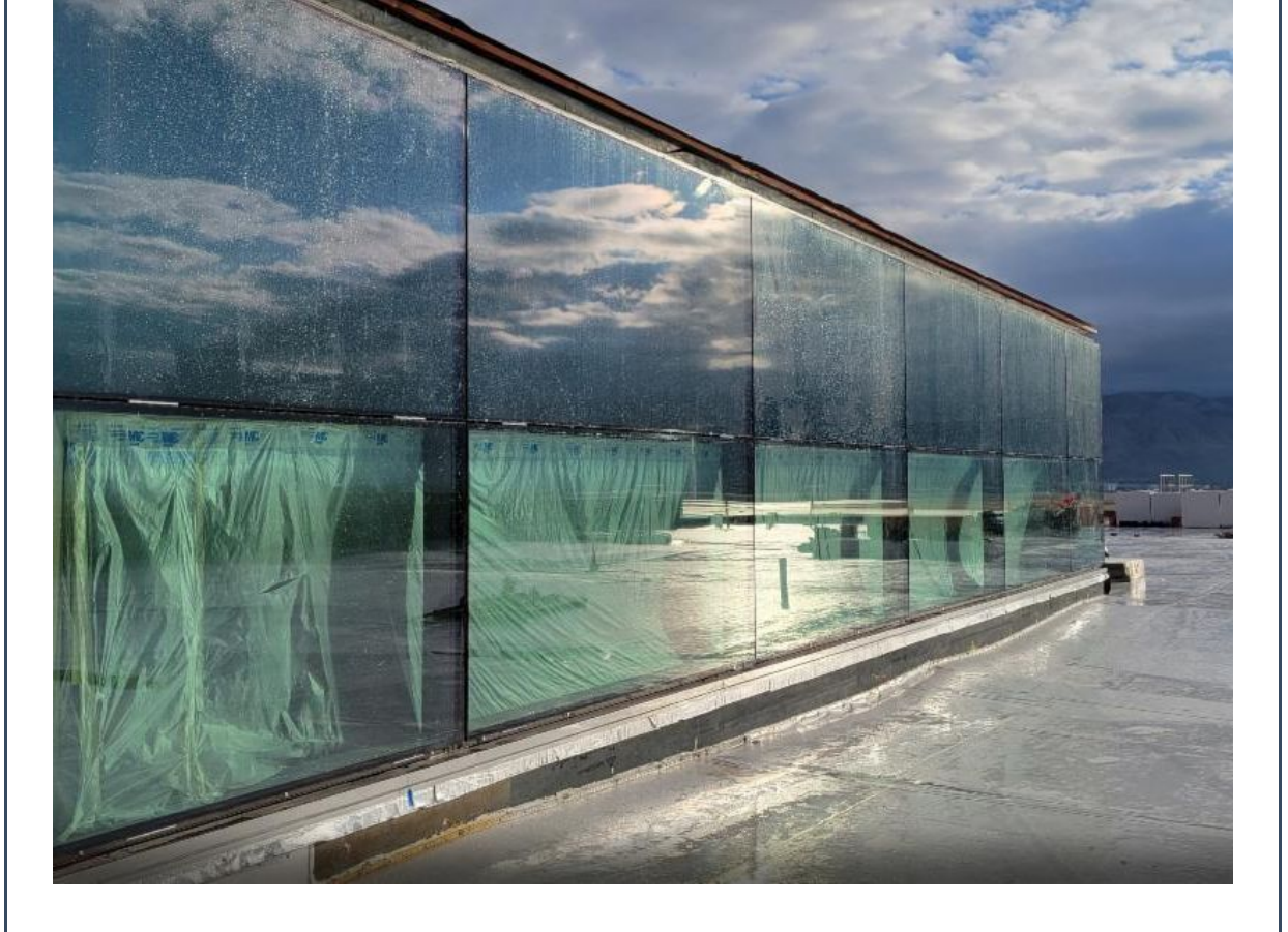
The clearstory penthouse on Concourse B-east, following glass installation.