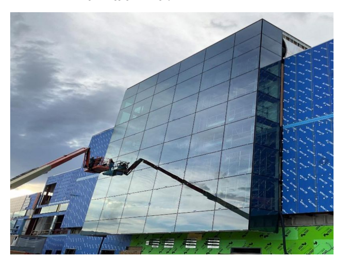
Curtain wall installation on the north side of the Concourse B Plaza

For more updates on construction progress, click here.