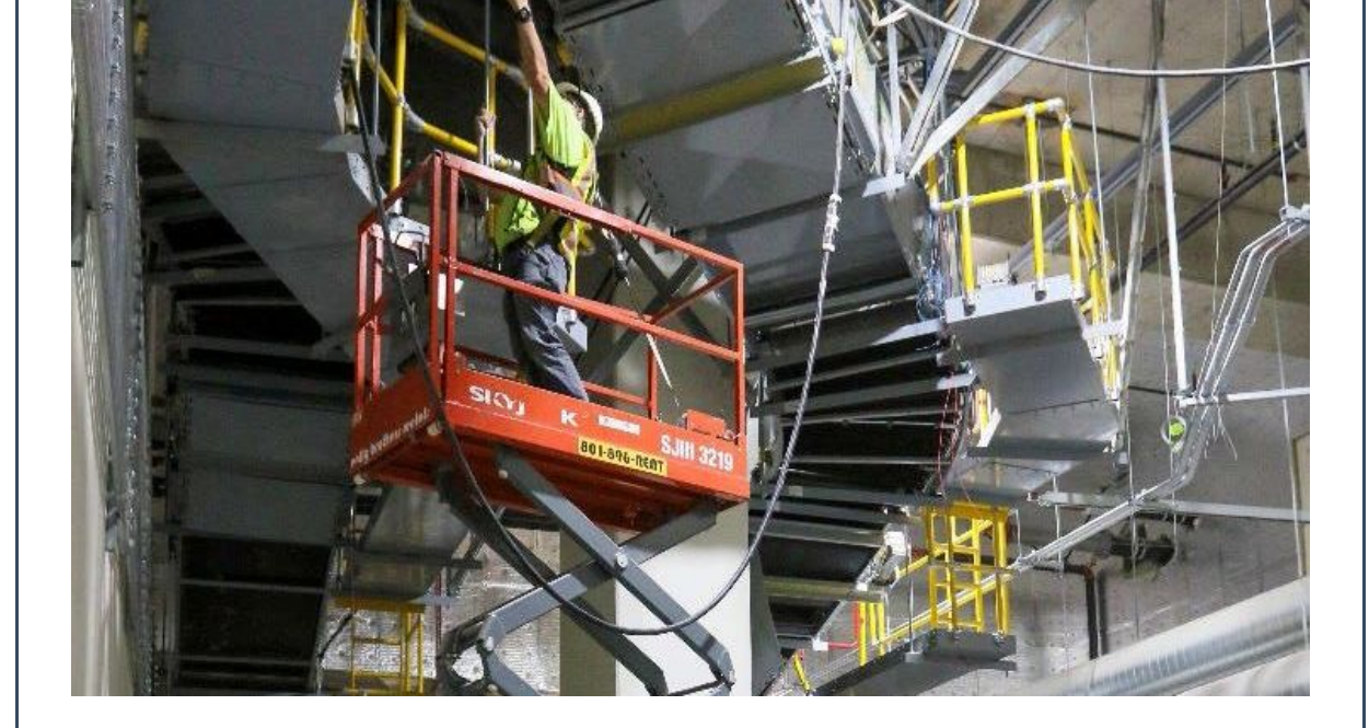
Installing the baggage handling system catwalk in the Central Tunnel