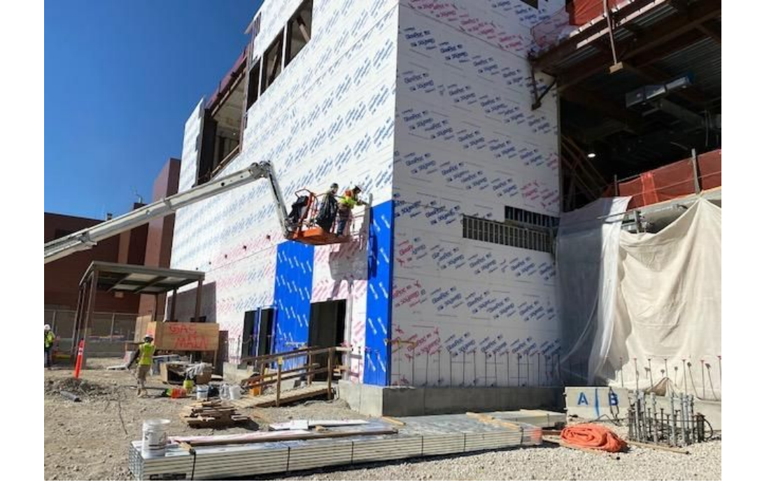
Concourse A-east exterior sheathing installation.