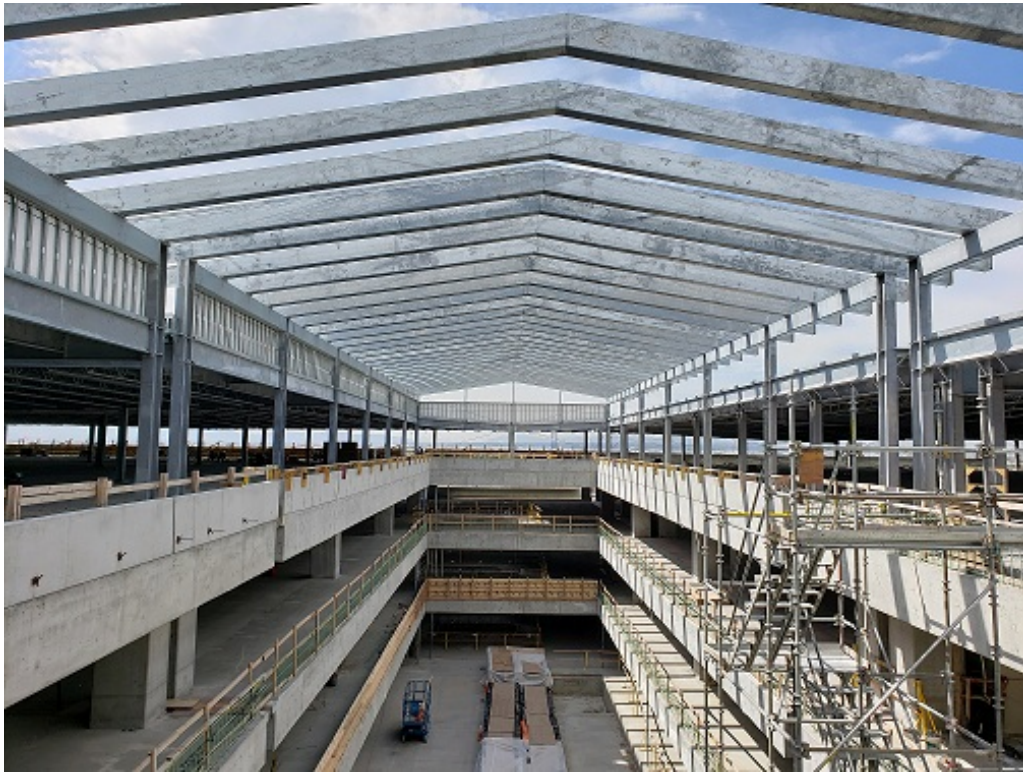
The New SLC parking garage roof steel erection