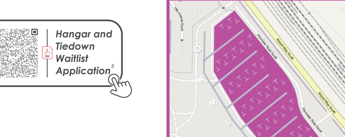
Northeast Airpark Tiedowns

δ Offices are rented and billed separately