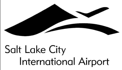
New Salt Lake City International Airport September 15th, 2020