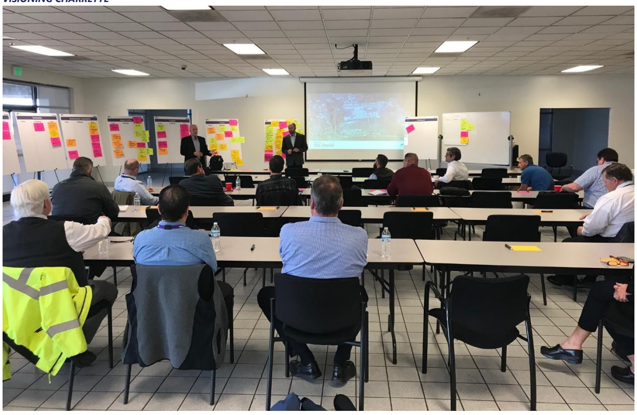
FIGURE 1-1 VISIONING CHARRETTE

Each board had three columns: "Topics," "Challenge," and "Vision," which were used to further guide the process and the comments provided, as shown in Figure 1-2 .