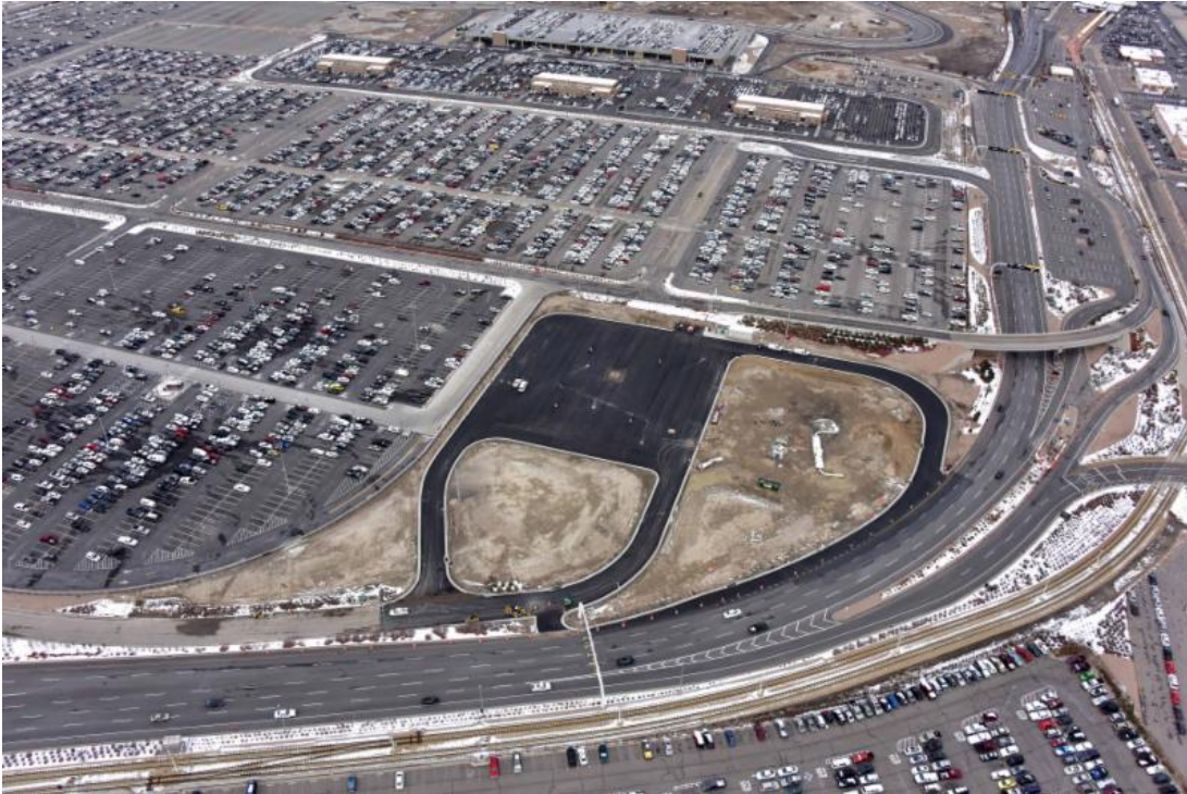
Future Park and Wait area on the south end of Terminal Drive

Construction of SLC's new Park and Wait lot is also taking shape. Crews have completed utility work and grading for the future lot along with creating entrance and exit lanes. Curb and gutters have been installed and asphalt has been laid.