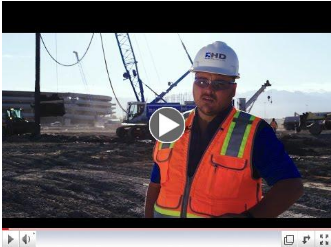
Underground Stone Columns - Stabilizing Soil at SLC

From May through October, more than 7,600 underground stone columns were installed at the construction site of The New SLC. Stone columns improve the ground by providing seismic stability. To learn more about stone column installation, check out the following YouTube video: