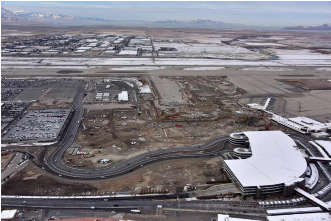
West facing view of the new terminal construction area

Site preparation for South Concourse-West is also in process. The building's footprint is now visible from an aerial view.