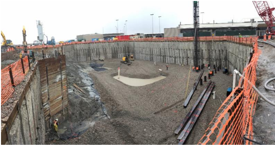
First steel pile driven into ground at the New SLC construction site

Additional construction underway on The New SLC includes tunnel excavation for the new terminal's baggage system and the first steel pile has been driven into the ground, signaling the start of vertical construction.