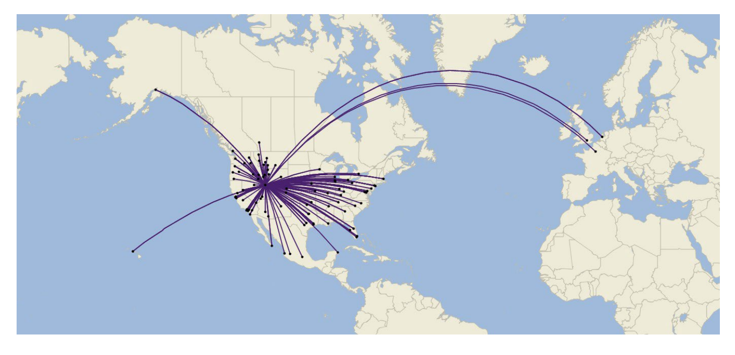
<u>June 2024</u> Average Daily Departing Seats: 47,000 Nonstop Destinations: 96