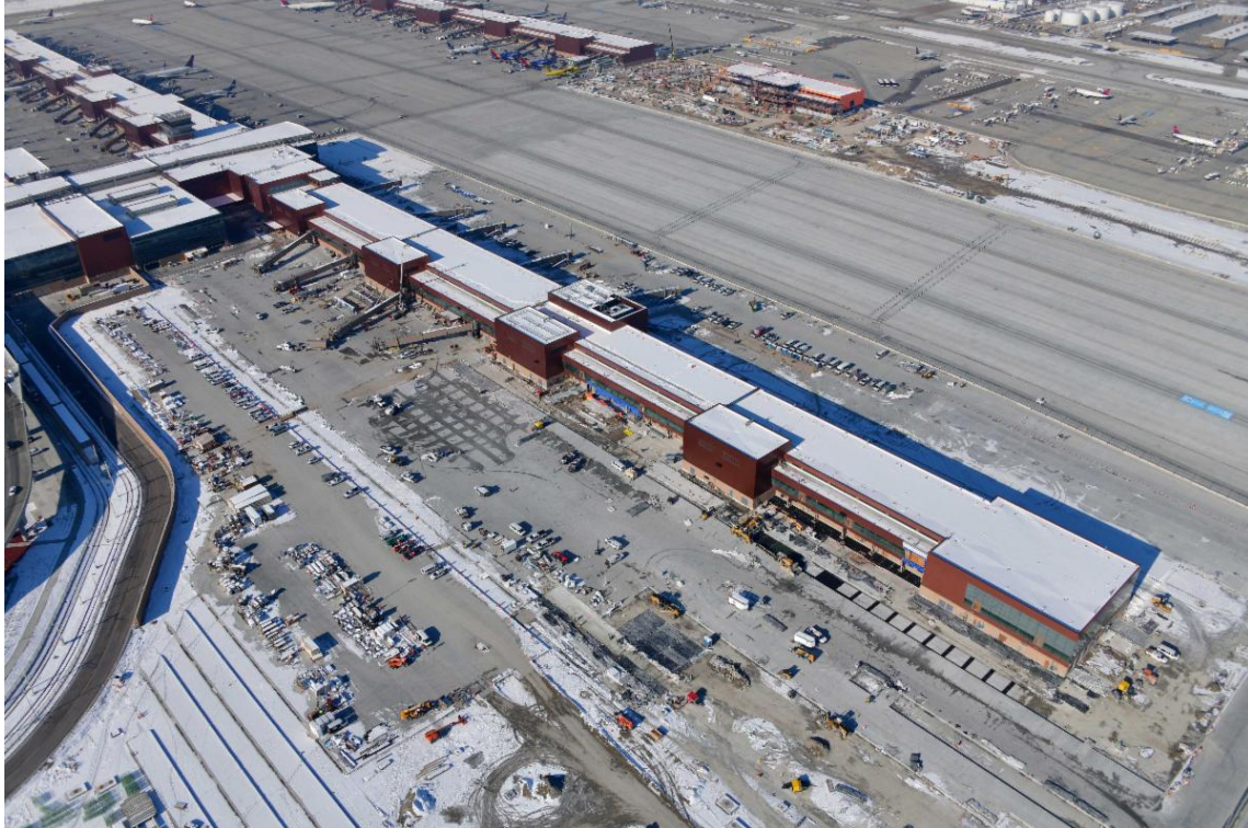
Aerial view of Concourse A-east and the beginnings of Concourse B-east, looking northwest