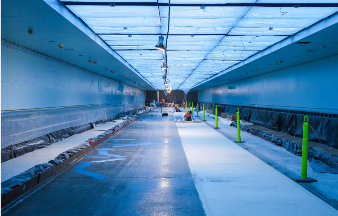
Preparing for Terrazzo flooring installation in the Central Tunnel