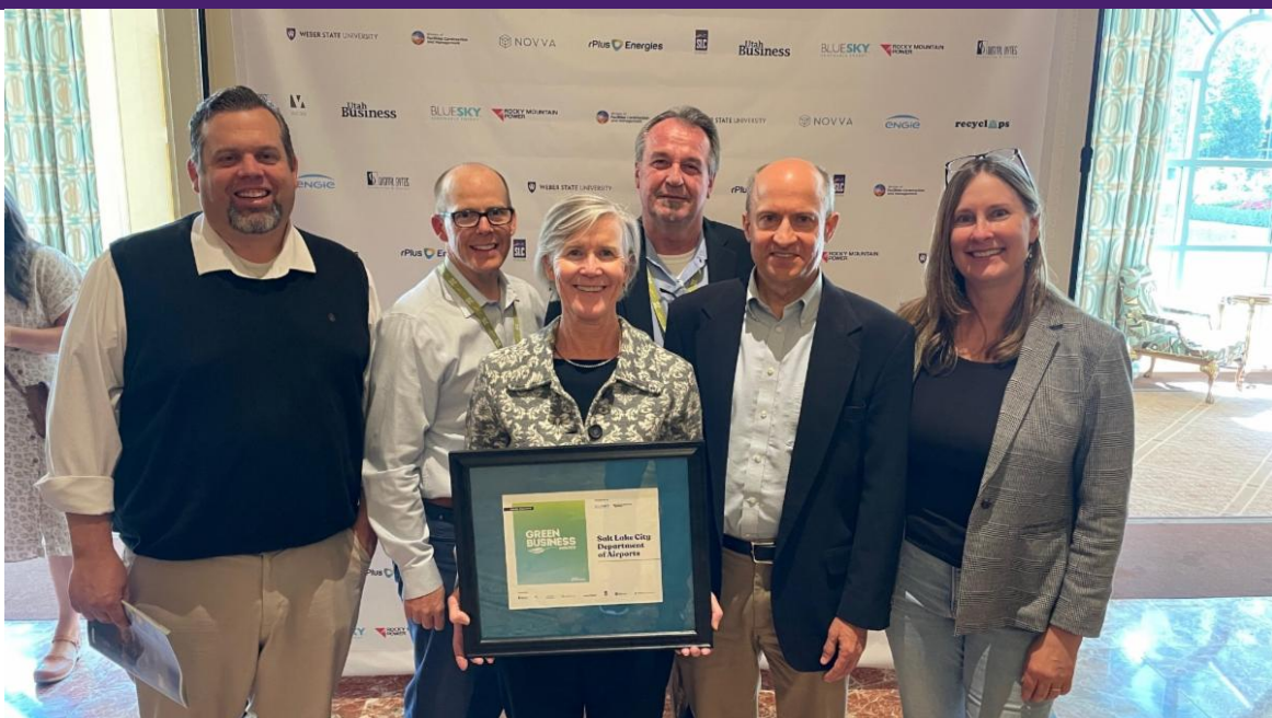
SLC's sustainability team receiving the Green Building Award from Utah Business

The New SLC was recently recognized for its sustainability efforts by Airports Going Green and Utah Business Magazine. The airport received awards from both organizations for its UTA light rail connection, the 96% reuse/recycle rate of construction waste, daylight-optimizing designs and energy-saving modes