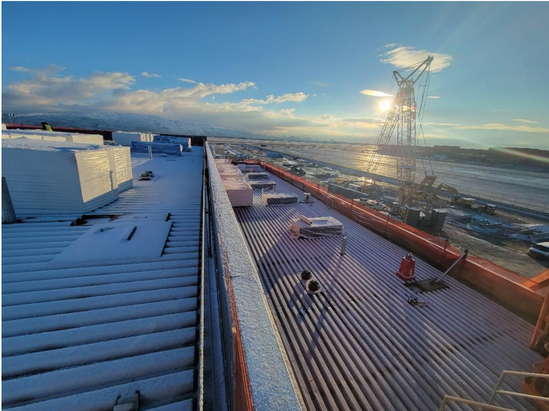
A frosty view of roofing materials on Concourse B-east

For more updates on the progress of Phase 2, click here .