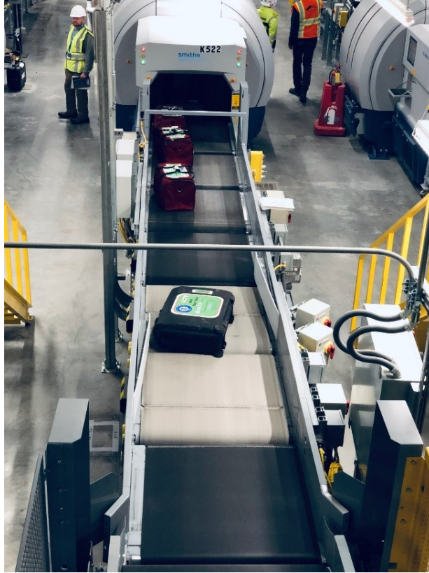
Testing of The new SLC baggage inspection system