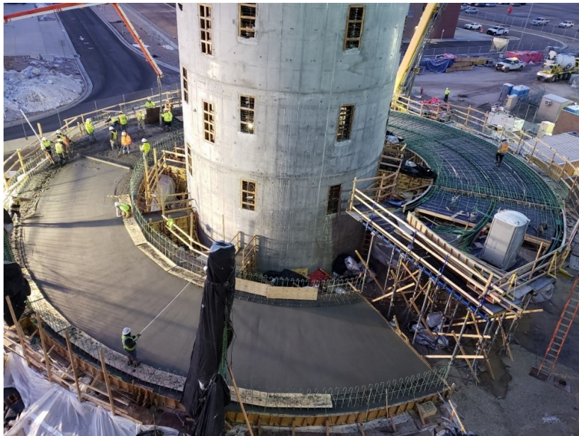
Helix under construction for The New SLC Parking Garage