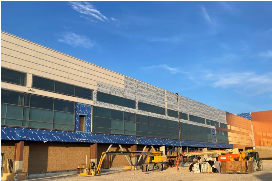
Metal panels being placed on the exterior of Concourse A-east.

For more updates on the progress of Phase 2, click here . To watch a new orientation video from level 1, click here .