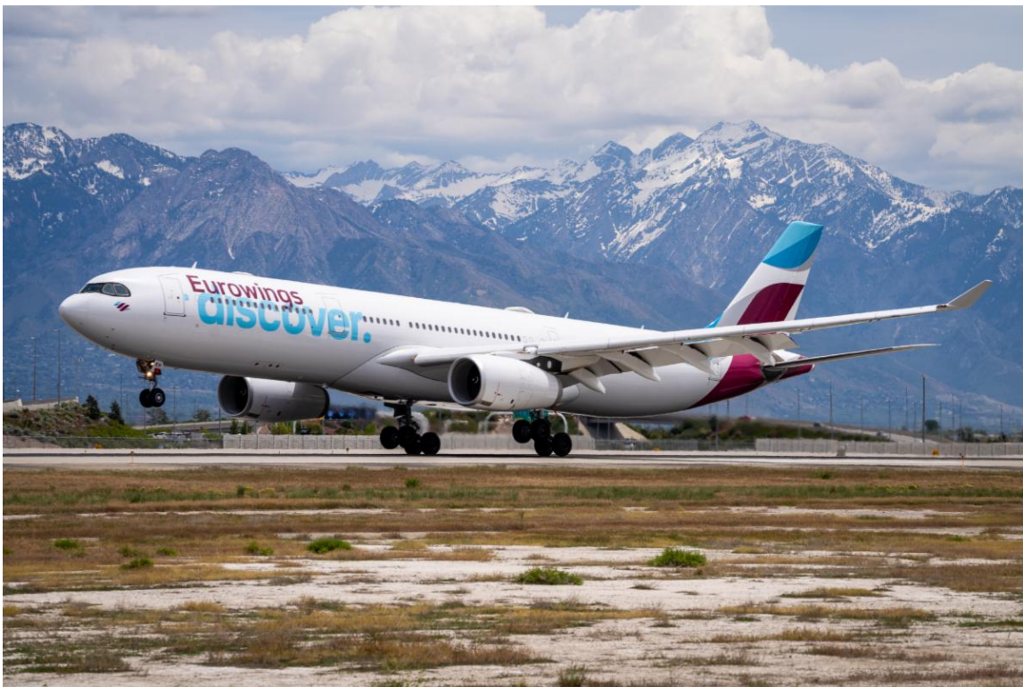
Eurowings Discover landing at SLC International for the first time on May 23.

On May 23, the much-anticipated Eurowings Discover flight from Frankfurt landed with great fanfare and celebration. This is the airport's first-ever direct flight to Germany and fourth destination in Europe. Three days later, Spirit Airlines' bright yellow planes entered Salt Lake City's skies for the first time with daily flights to Las Vegas, Los Angeles and Orlando. The ultra-low-cost carrier hopes to make travel more affordable in the area by offering low fares to the places people want to go most.