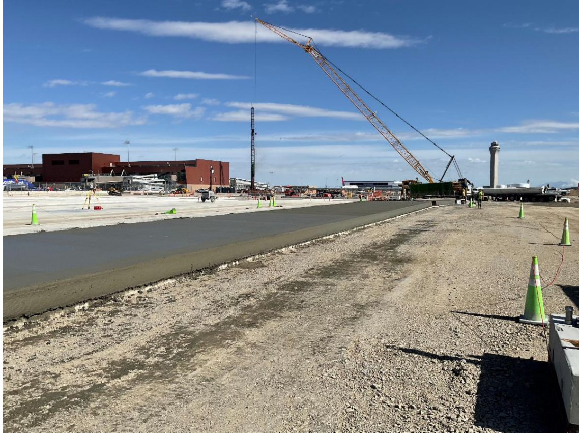
Paving over the Central Tunnel to prepare for future airplane taxiing.