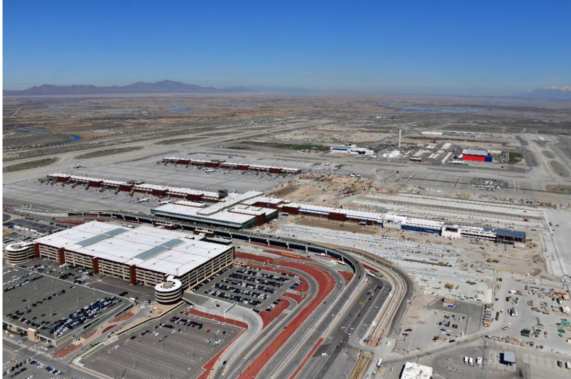
Aerial view of the Terminal, Concourses A and B, and the Central Tunnel, looking north.