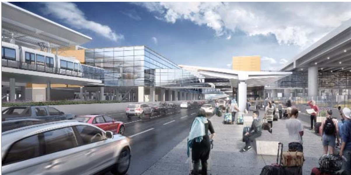
New Gateway Center on left will include car rental agencies and other ground transportation options.

Another element that is important to our visitors is the convenience of the rental car facilities. In the new terminal, passengers will still be a short walk from the rental car counters as they are today, rather than traveling to remote facilities. The “Gateway Center” between the terminal and new parking garage will include 10 car rental brands and other ground transportation options.