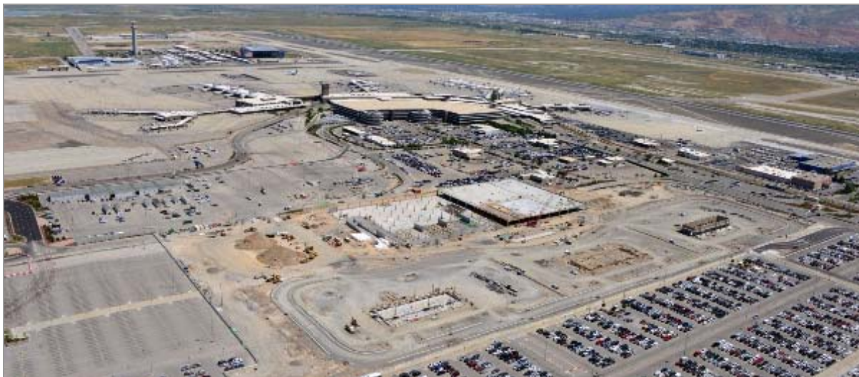
The first major project in The New SLC reconstruction program, visible in the center of the photo, is building Quick Turn-Around and Rental Service Site facilities for rental car agencies. Rental counters will remain next the new terminal, as they are today.

The QTA/RSS buildings will be complete in March 2016, after which their old counterparts will be demolished.