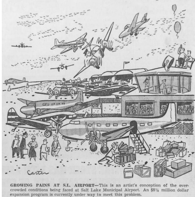
GROWING PAINS AT S.L. AIRPORT —This is an artist's conception of the overcrowded conditions being faced at Salt Lake Municipal Airport. An $8½ million dollar expansion program is currently under way to meet this problem.