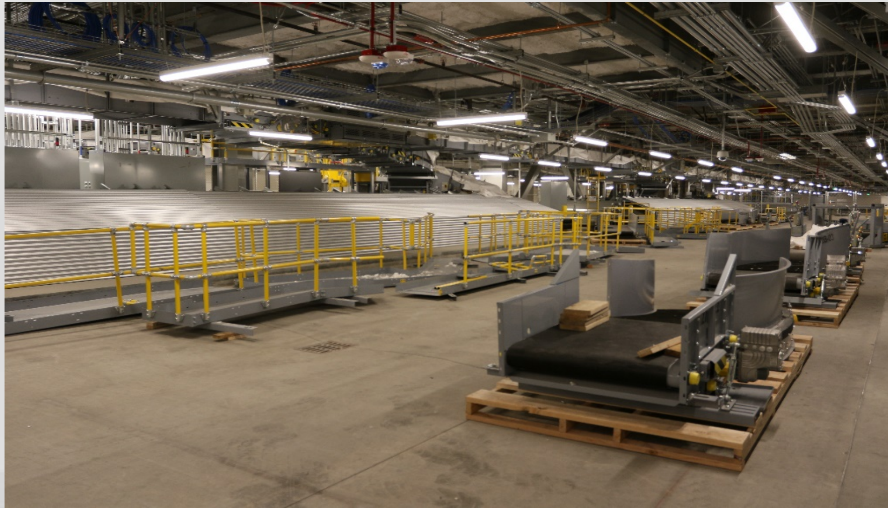
BHS Conveyor Removal