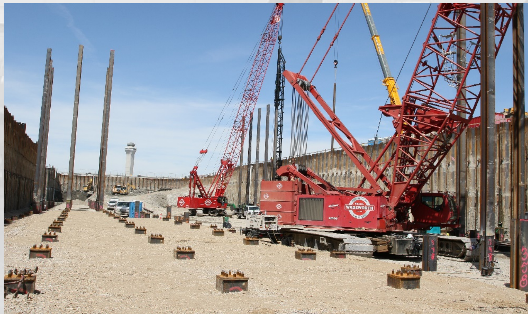
H-Pile Driving Area B