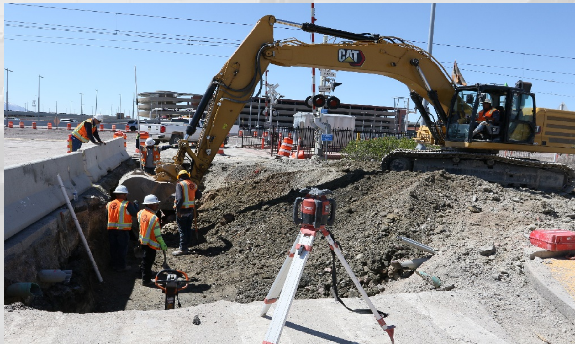
Electrical Ductbank excavation along 3700 W