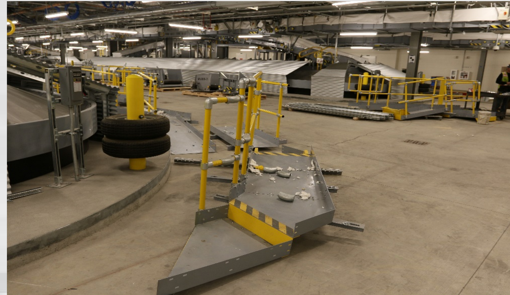
BHS Catwalk Removal