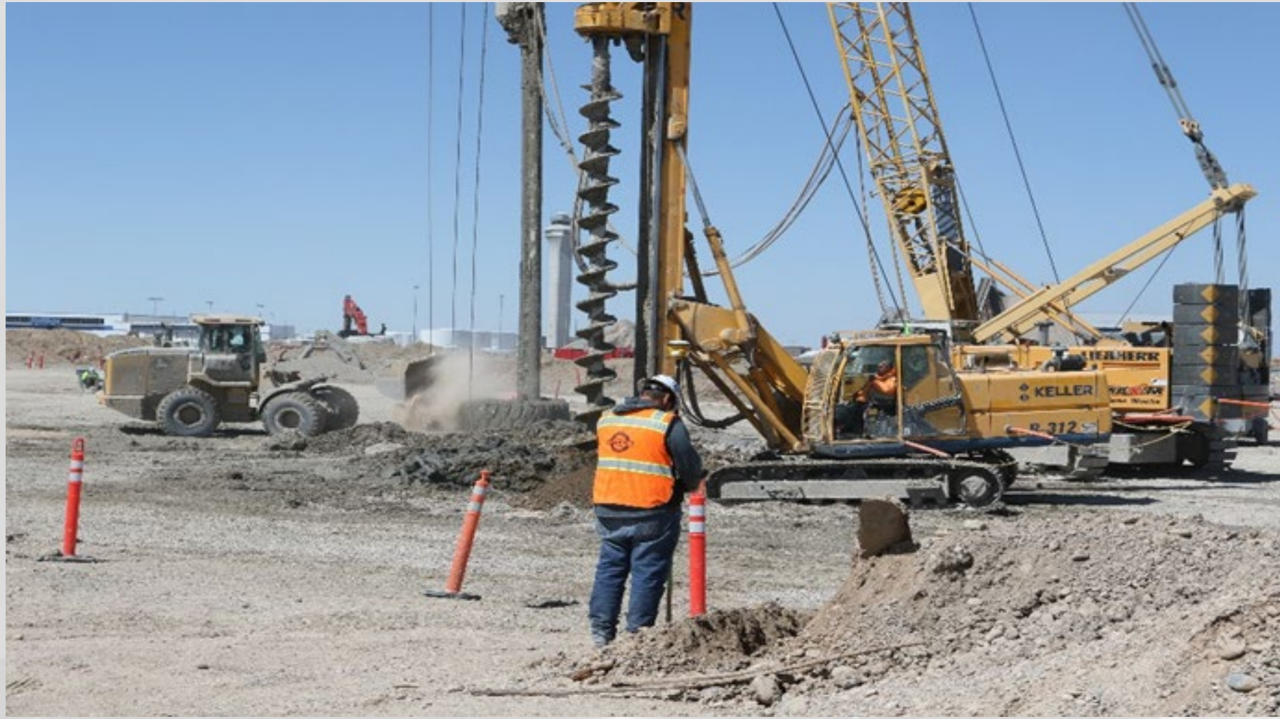
Stone Columns Area E