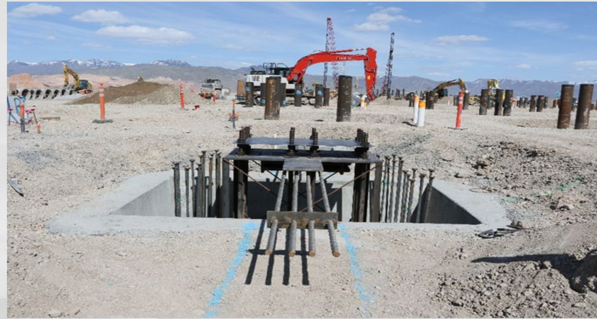
Pile Cap Sheer Lug Assembly