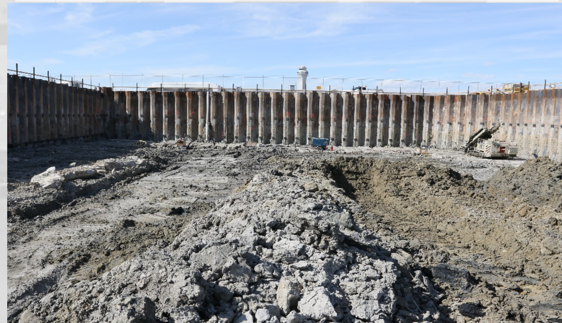
Concourse B Basement / Area G Excavation