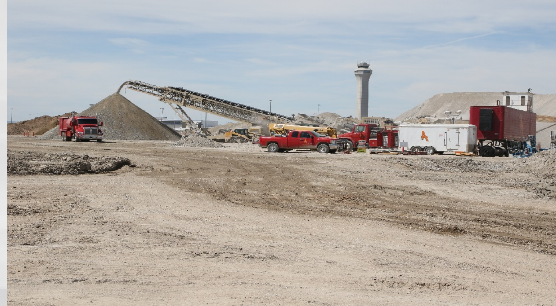
On-site Concrete Crushing continues