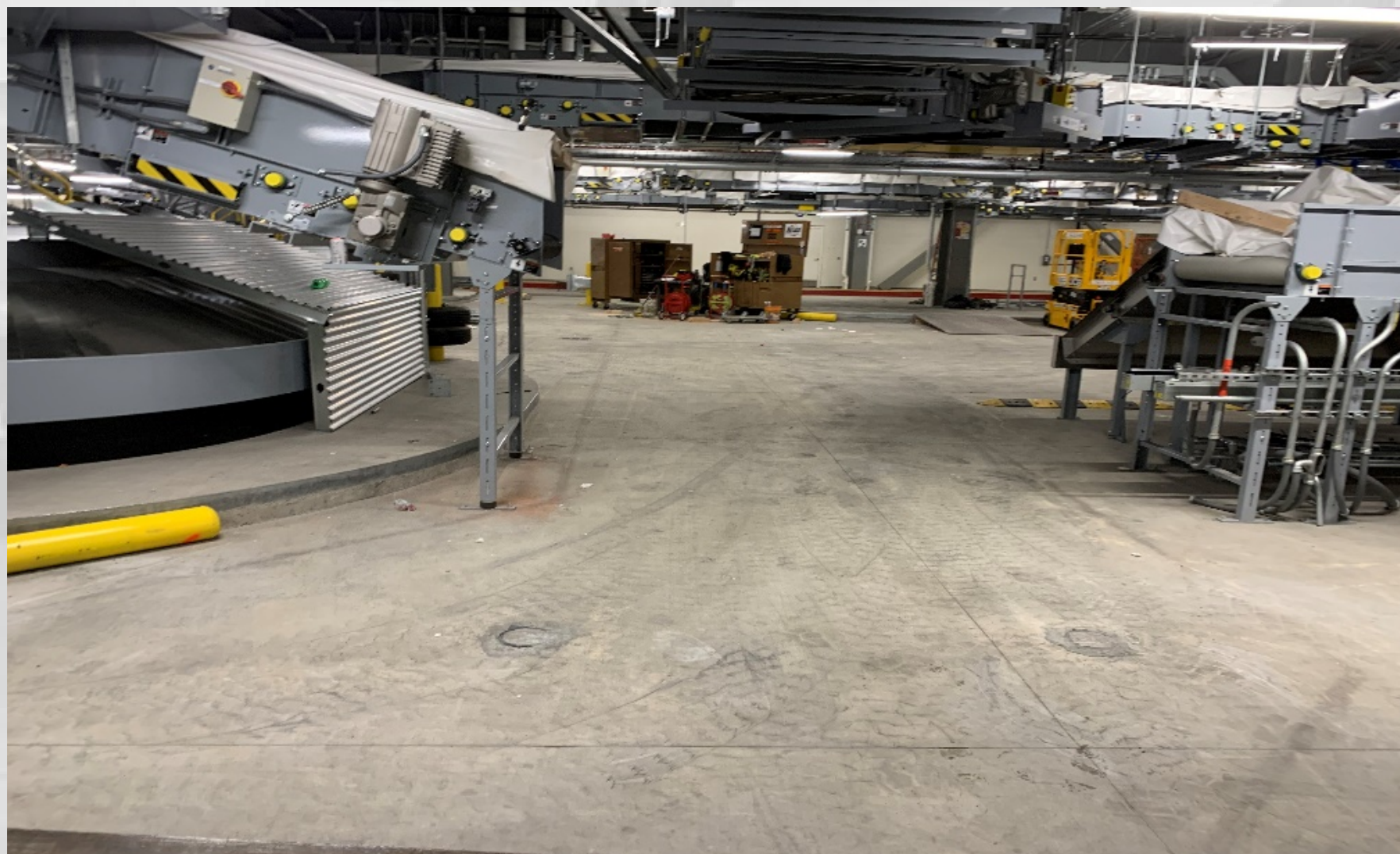
BHS Bollard Removal