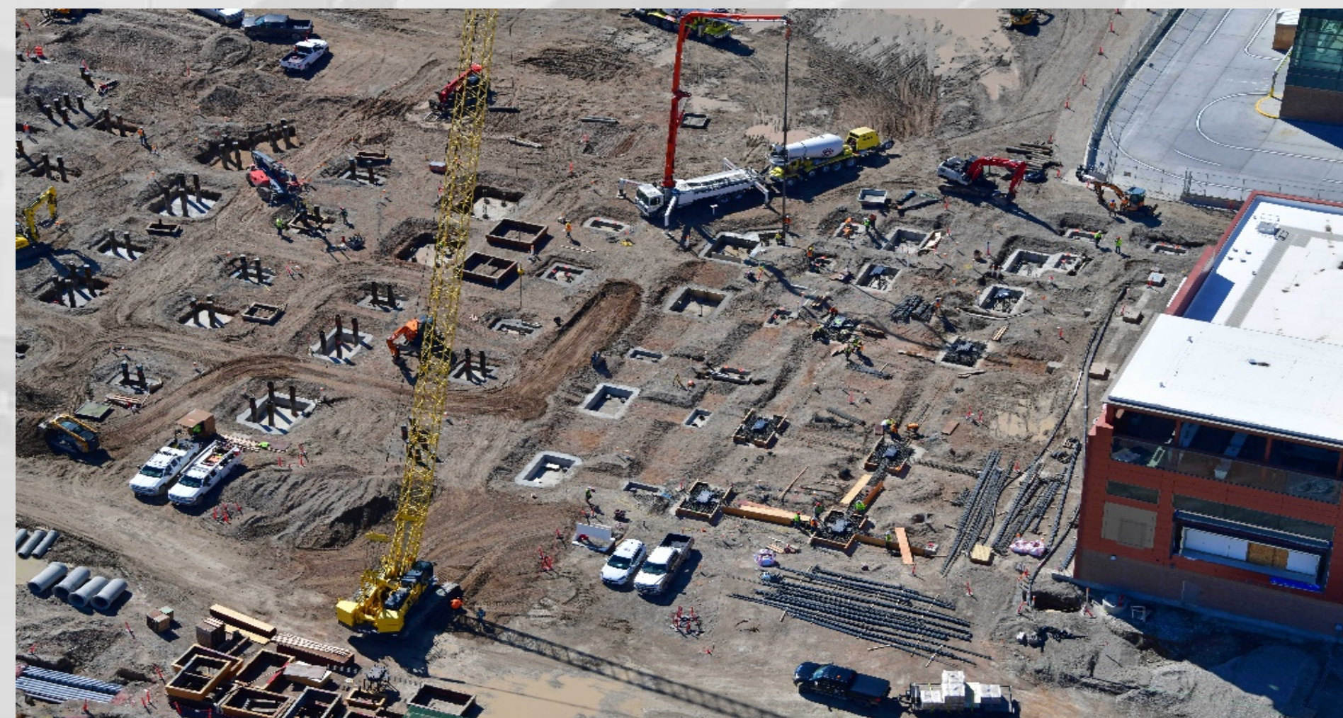
SCE Pile Cap & Formwork Assemblies