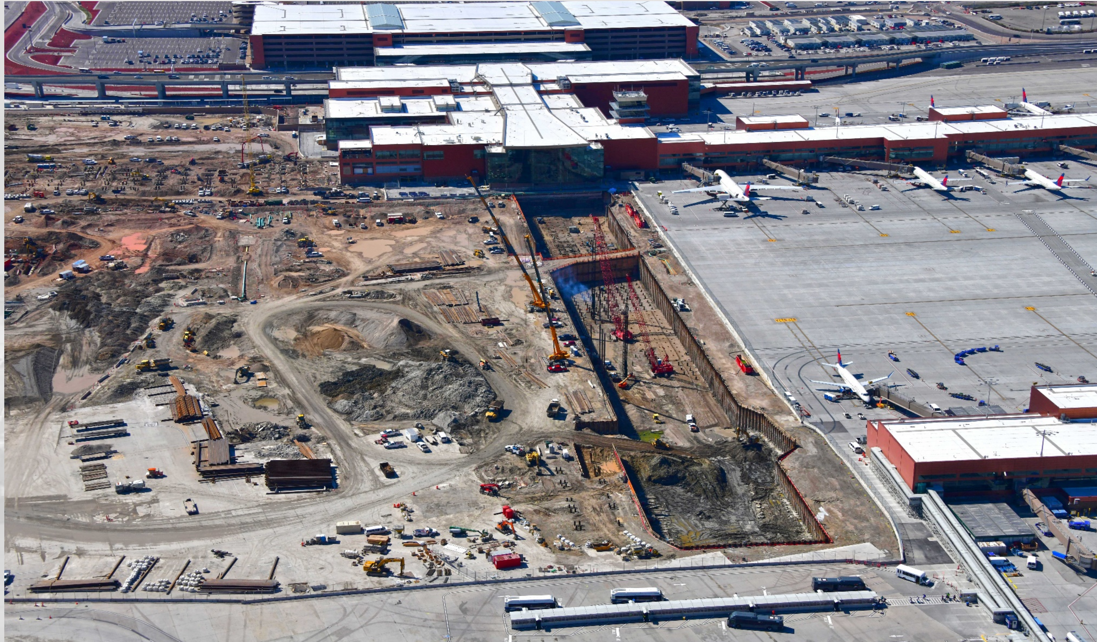
Central Tunnel Looking South