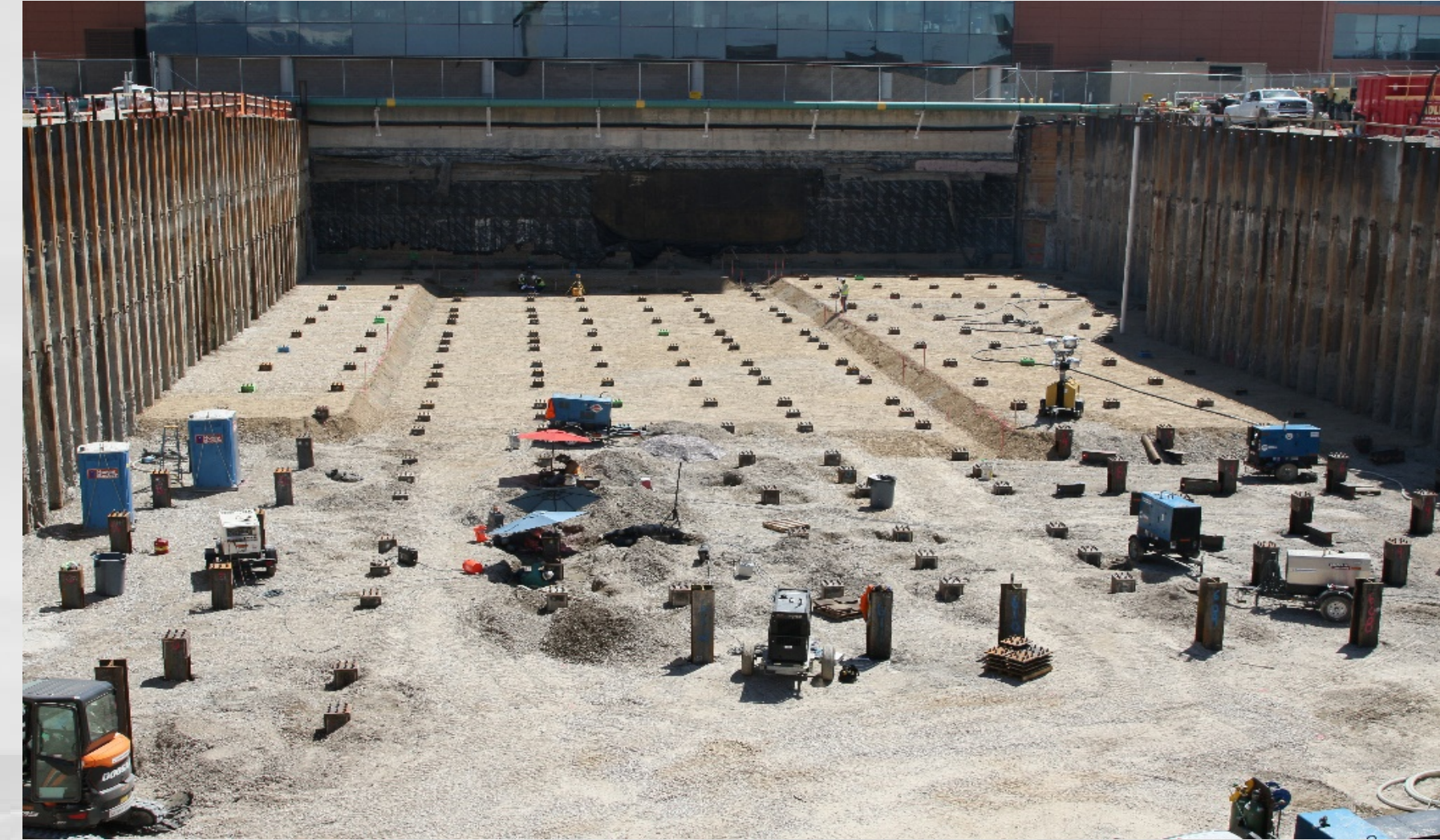
H-Pile Driving Complete Areas C & D