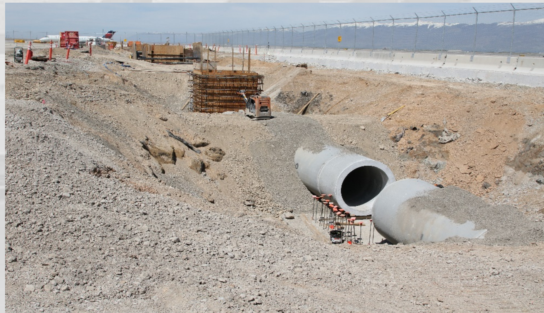
Area 1 60-inch Storm Line