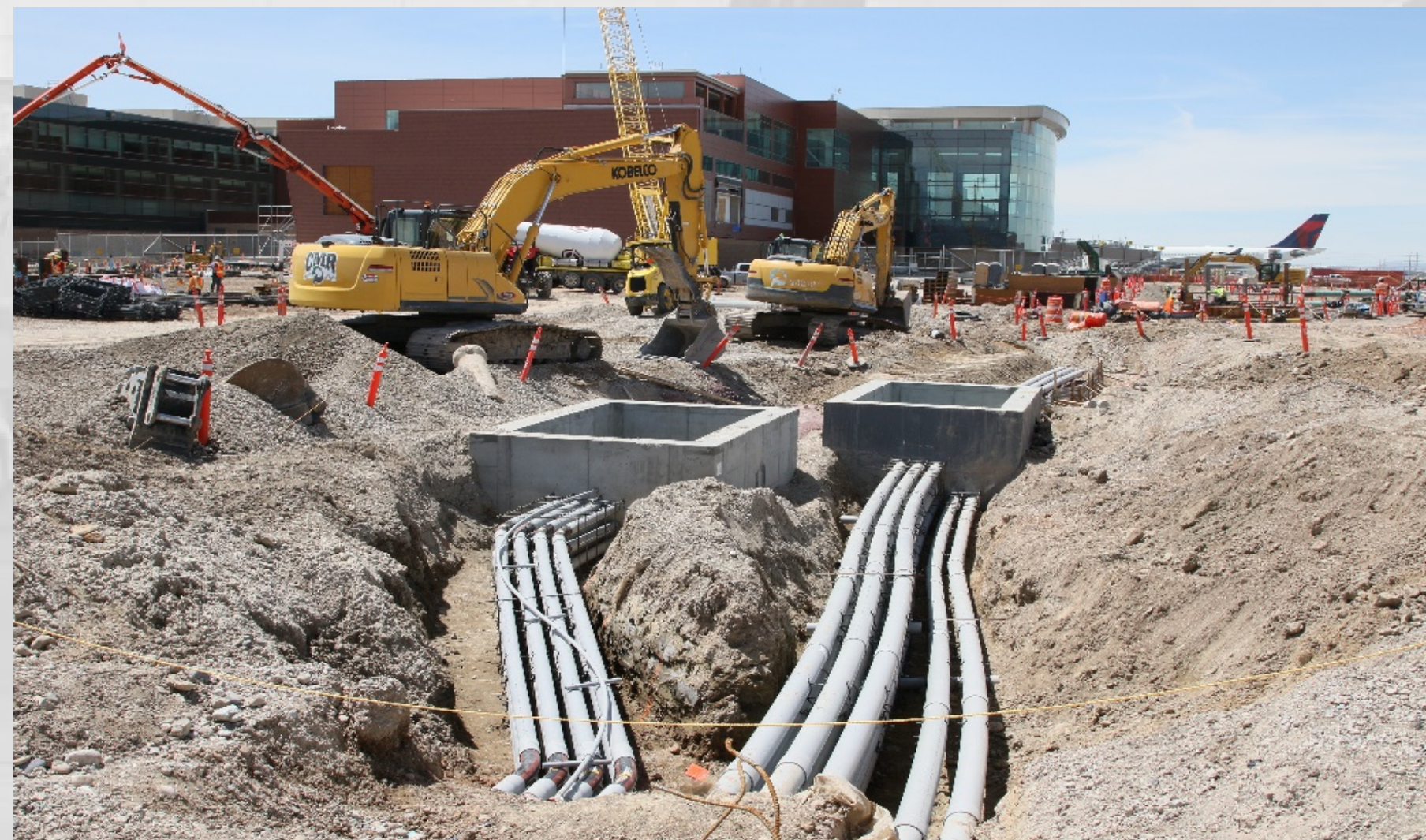
Electrical Ductbank Tie-ins