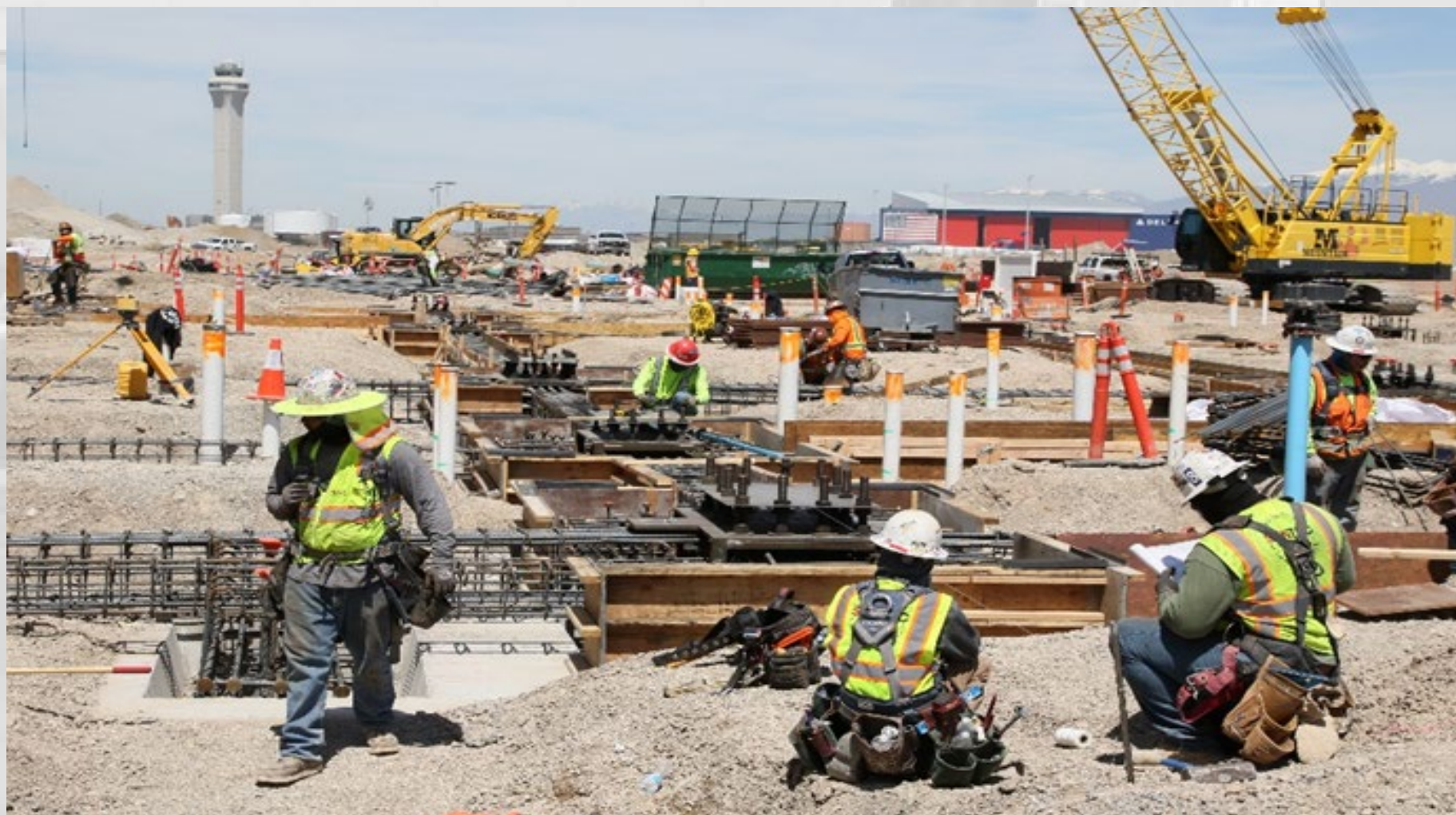
SCE Pile Cap & Grade Beam Formwork