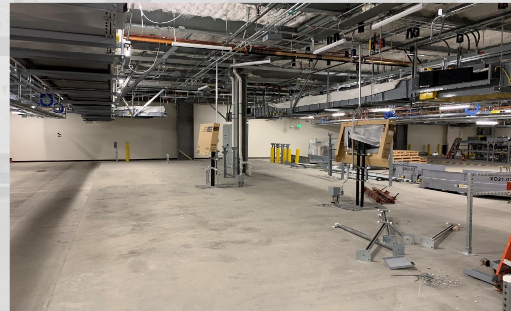
Holdroom Area Prep