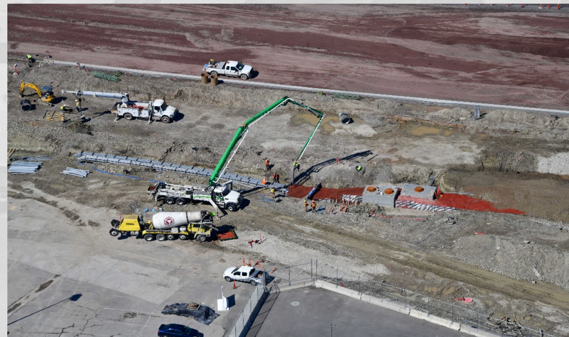
Electrical Ductbank installation along 3700 W