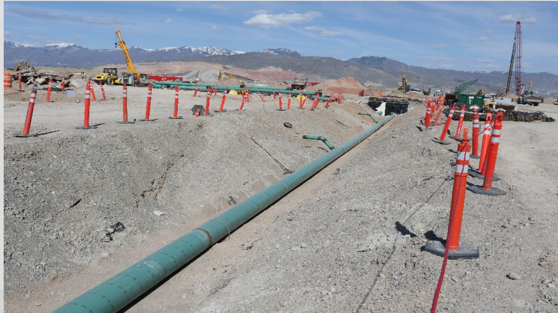
Fuel Line Tie-in